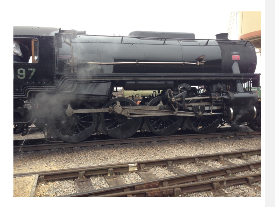
Figure 3: Preserved USA S160 locomotive 5197 in Toddington yard, 28 May 2018

Seeing different locomotives is part of the attraction for enthusiasts so they are often moved around to work on other railways or to appear at special events. The Studley heavy haul firm Allelys is a leading mover of railway vehicles by road and there is one locomotive that I have only ever seen on an Allelys trailer at speed on the M42.