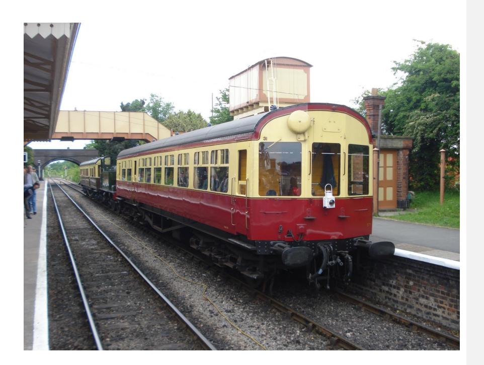
Figure 3: Re-created auto-train at Toddington.