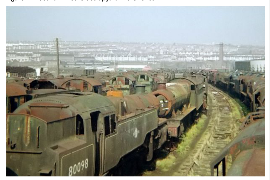
Figure 4: Woodham Brothers scrapyard in the 1970s

The GWSR has locomotive engineering workshops at Toddington and carriage and wagon workshops at Winchcombe. Steam locomotives are generally owned by specialist groups and societies rather than by the railway itself, but at any one time quite a number are based and maintained here and are hired to the railway to run services. Steam locomotives are often