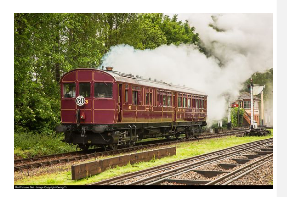
Figure 2: Preserved GWR Rail-Motor.

By the 1930s on this line and elsewhere rail-motors had been abandoned and replaced by 'auto-trains'. These were small tank engines attached to one or more 'auto-coaches' that had a driving compartment at one end and linkages to the locomotive controls. The locomotive was usually at one end of a one coach train but could be in the middle of two or even more coaches, see figure three. When operated with the coach leading the driver sat in the driving compartment facing the direction of travel and had full control of the brakes and with the cooperation of the firemen on the locomotive footplate, a degree of control over the locomotive. The advantage over a rail-motor was greater flexibility and the power to take extra carriages at busy times. (see <a href="https://citytransport.info/Steam-MU.htm">https://citytransport.info/Steam-MU.htm</a> ). Rail-motors were converted into auto coaches by removing the boiler and engine. Despite these economy measures local passenger services ceased in 1960.